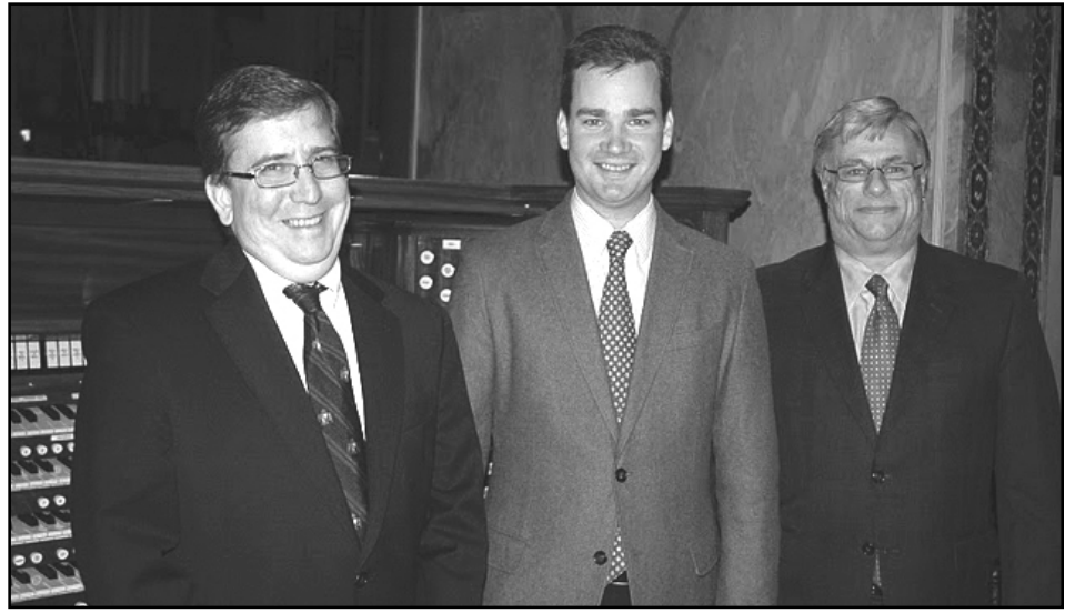
January Program Guest

Please remember that, as chapter members, you are always welcome at Executive Committee meetings. We appreciate hearing from you via e-mail or phone as well.